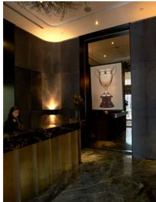
Reception, The Hazelton Hotel

One of the biggest areas of growth for Elevator has been with the design and decor communities. From 400 suite hotel refurbishment projects to a custom 5-star boutique hotel, Elevator has successfully handled such projects in house, from start to finish; photography, printing, mounting, framing, finishing, packaging, and in some cases, installation.