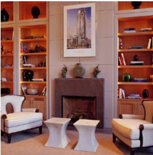
One Bedford, Presentation Centre

From private residences, to corporate offices, to hotels and sales centres; Elevator produces the job from concept through to installation.